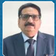
Justice Shri SantParkash Hon'ble Chairperson (Punjab State Human Rights Commission)