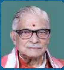
Padma Vibhushan Dr. Murli Manohar Joshi Former Home Minister of India