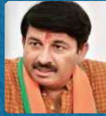
Shri Manoj Tiwari Hon'ble Member of Parliament