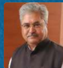
Shri Dushyant Gautam Hon'ble Former Rajya Sabha Member and National General Secretary BJP, New Delhi.