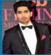
Padmashree Shri Vijender Singh, Indian Boxer