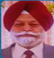
Shri S SSandhu, Hon'ble ADGP JK POLICE (Rtd)