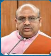
Shri Vijender Gupta Hon'ble Speaker, Delhi Legislative Assembly