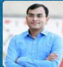
Shri Shyam Sundar Pathak , Asst. Commissioner, GST, Govt. of UP.