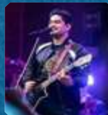
Shri Amit Mishra Hon'ble Indian singer, songwriter, Voice Actor and Live Performer.