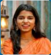
Ms. Maithali Thakur Hon'ble MLA, Bihar Legislative Assembly