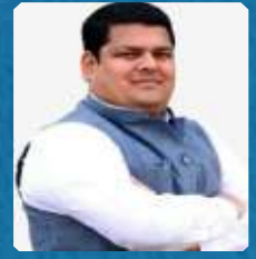
Shri Priyank Kanoongo Hon'ble Member, National Human Rights Commission, Govt. of India.