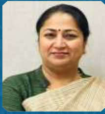
Smt. Rekha Gupta Hon'ble Chief Minister, Delhi