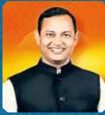
Shri Ravinder Indraj Singh Hon'ble Cabinet Minister, Delhi