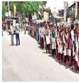
రాష్ట్రంలో పాఠశాల విద్యార్థులు

మనరు, న్యూస్టుడే: కోల్ కతా హత్యచార సంబంధించి దోషులను కలిసినగా శిక్షించాల్సిన విధానం రాష్ట్ర చీఫ్ జడ్జి పట్టణం పుత్తూరు ఉన్నత పాఠశాల, ప్రభుత్వ జూనియర్ విద్యార్థులు ప్రధాన రోడ్డులో ప్రదర్శన నిర్వహించారు. కార్యక్రమంలో నేషనల్ హ్యూమన్ రైట్స్ ట్రస్ట్ సభ్యులు పాల్గొన్నారు.