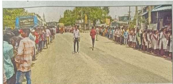
రాష్ట్ర నిర్వహిస్తున్న విద్యార్థులు